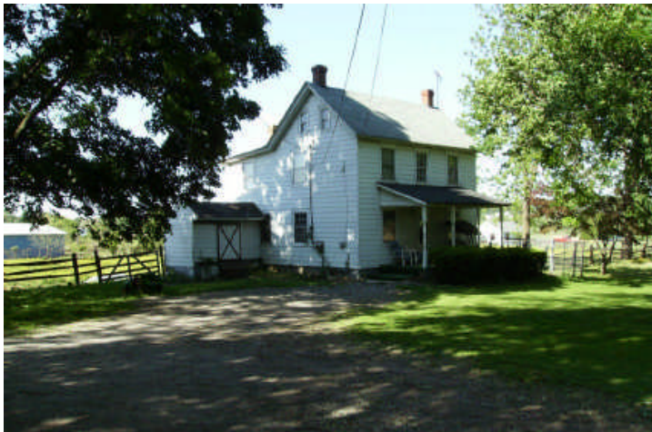
Smaller Existing Dwelling