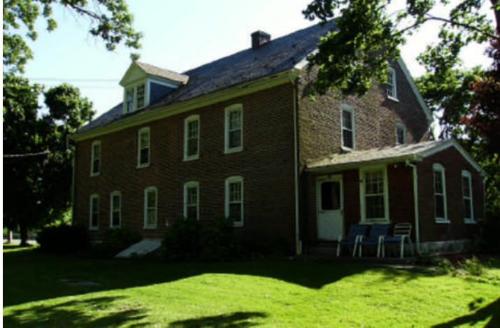
5,000 S/F Vintage House